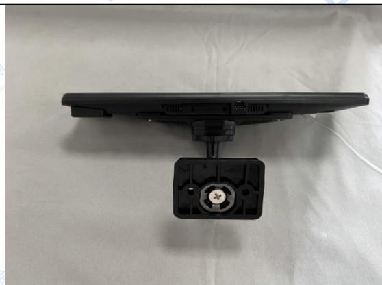
Fig.2 Appearance inspection before test