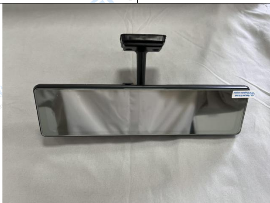
Fig.3 Appearance inspection before test