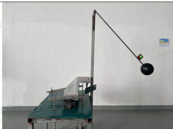
Fig.5 Test setup

Declaration: The test results of this test report are only responsible for the tested samples; This test report is invalid without special seal for test report, cross-page seal and signature. This report shall not be partially copied without the written permission of ORT Test setup; The items with "*" in the report are subcontracted inspection items; Test items that has not obtained qualification recognition or recognition, and is only used for scientific research, teaching or internal quality control; If the client has any objection to the test results, it shall appeal to the lab within 15 days after receiving the report and any late application would not be considered.