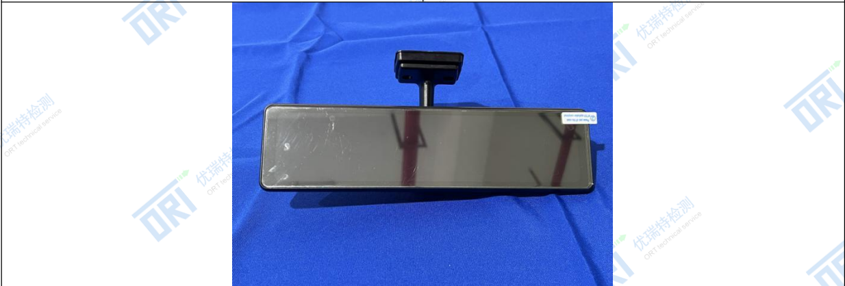
Fig.8 Appearance inspection after test