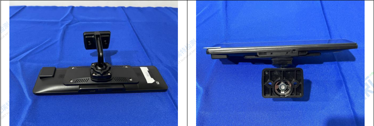
Fig.6 Appearance inspection after test