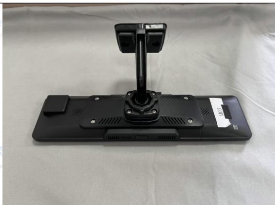
Fig.1 Appearance inspection before test